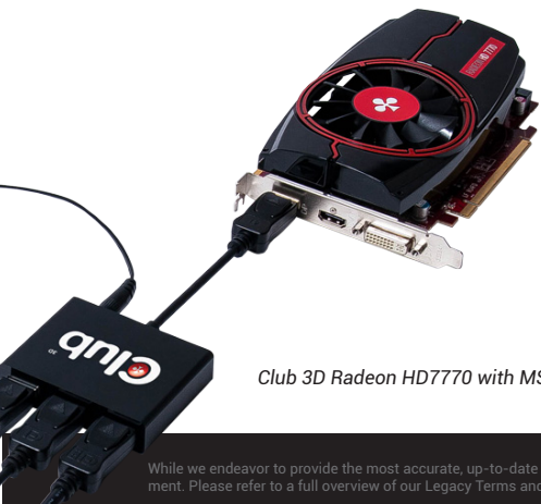
Club 3D Radeon HD7770 with MST Hub