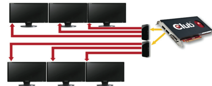
Illustration of two CSV-5300 on a six monitor configuration